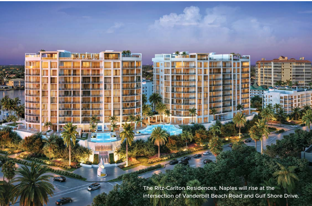
The Ritz-Carlton Residences, Naples will rise at the intersection of Vanderbilt Beach Road and Gulf Shore Drive.

WITH ITS STELLAR DESIGN TEAM, THE RITZ-CARLTON RESIDENCES, NAPLES RAISES THE BAR CONSIDERABLY ON CONDO LIVING