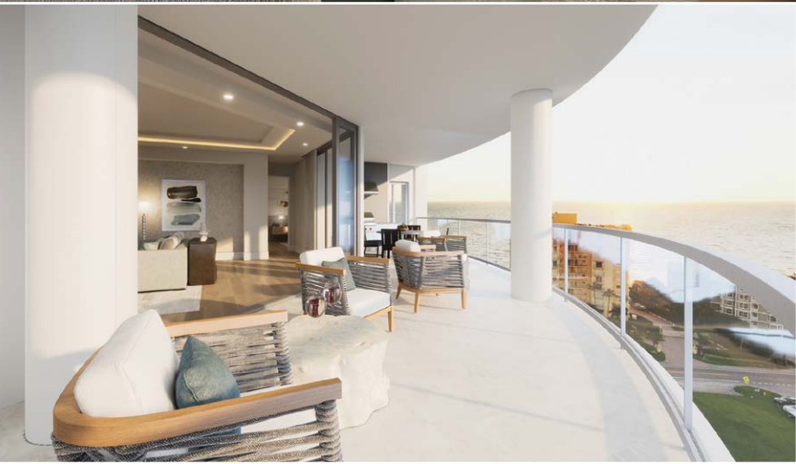
ABOVE: Due to its prime location, the residence's ample terraces will offer views of Vanderbilt Beach and the Gulf of Mexico. BELOW: Pool decks will make up the many amenities, which also include a marina, a putting green, dog-walking trails, and a full-service spa.