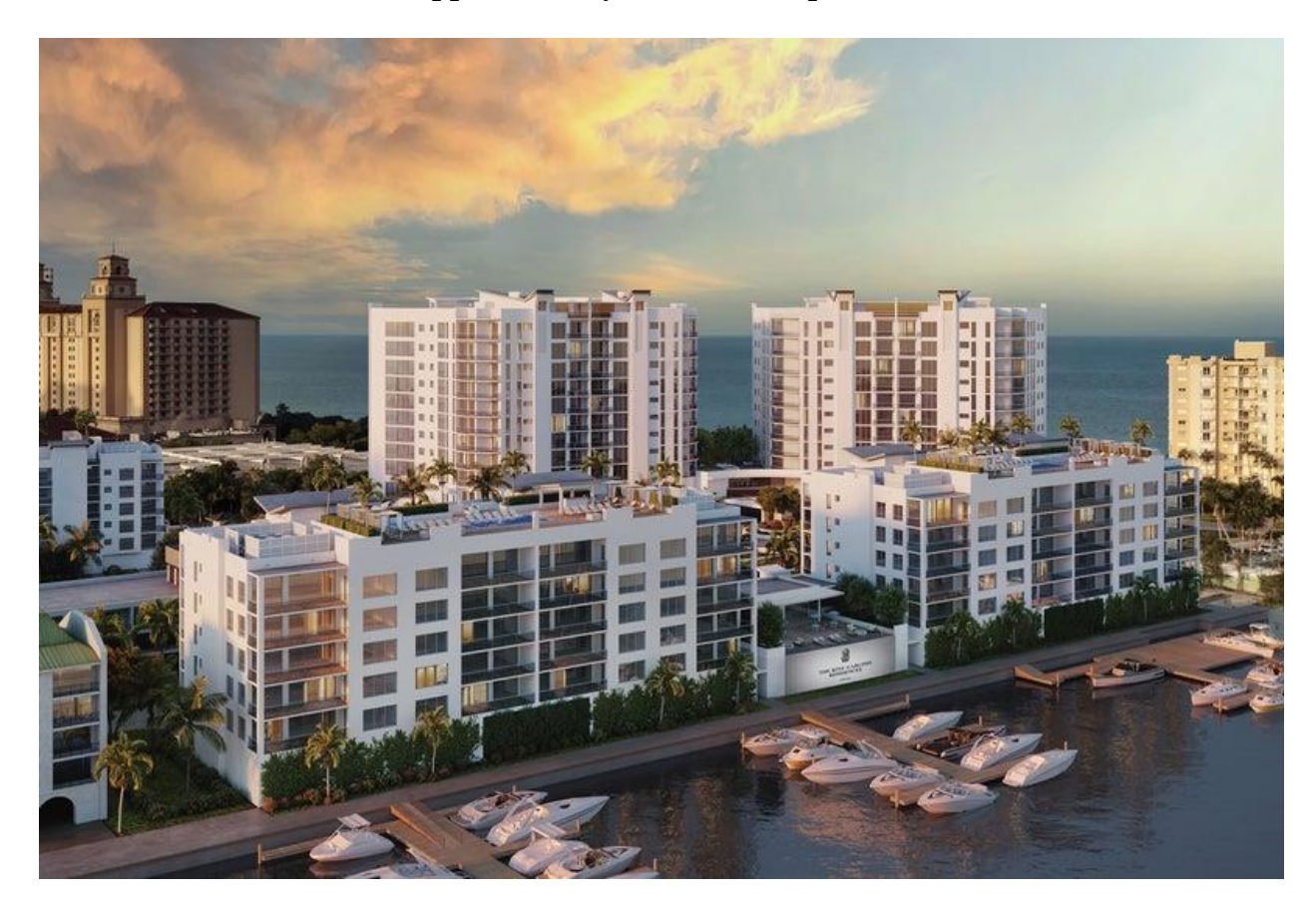
<u>View Ritz-Carlton Residences Naples >></u>

Residences are furthermore located directly between Naples' two existing Ritz-Carlton hotels -- both of which are approximately three miles apart.