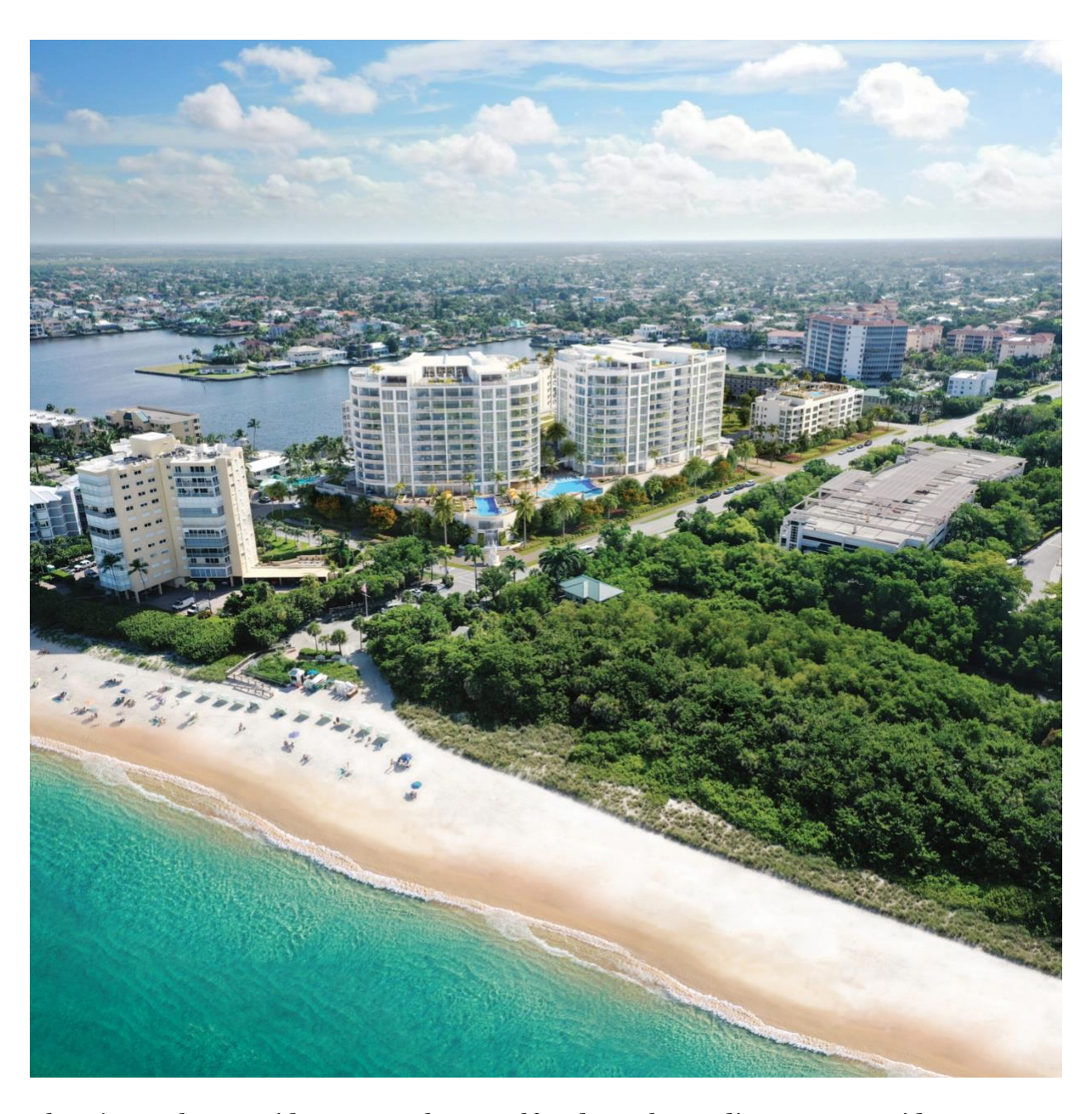
The Ritz-Carlton Residences, Naples – Gulf and Beach.

The six-acre development has surpassed 50% in sales, achieving $300 million in preconstruction transactions. This significant sales milestone is attributed to the project's desirable features, such as access to Vanderbilt Beach, high-touch concierge services, generously sized designer homes, and over 50,000 square feet of amenities managed by The Ritz-Carlton.