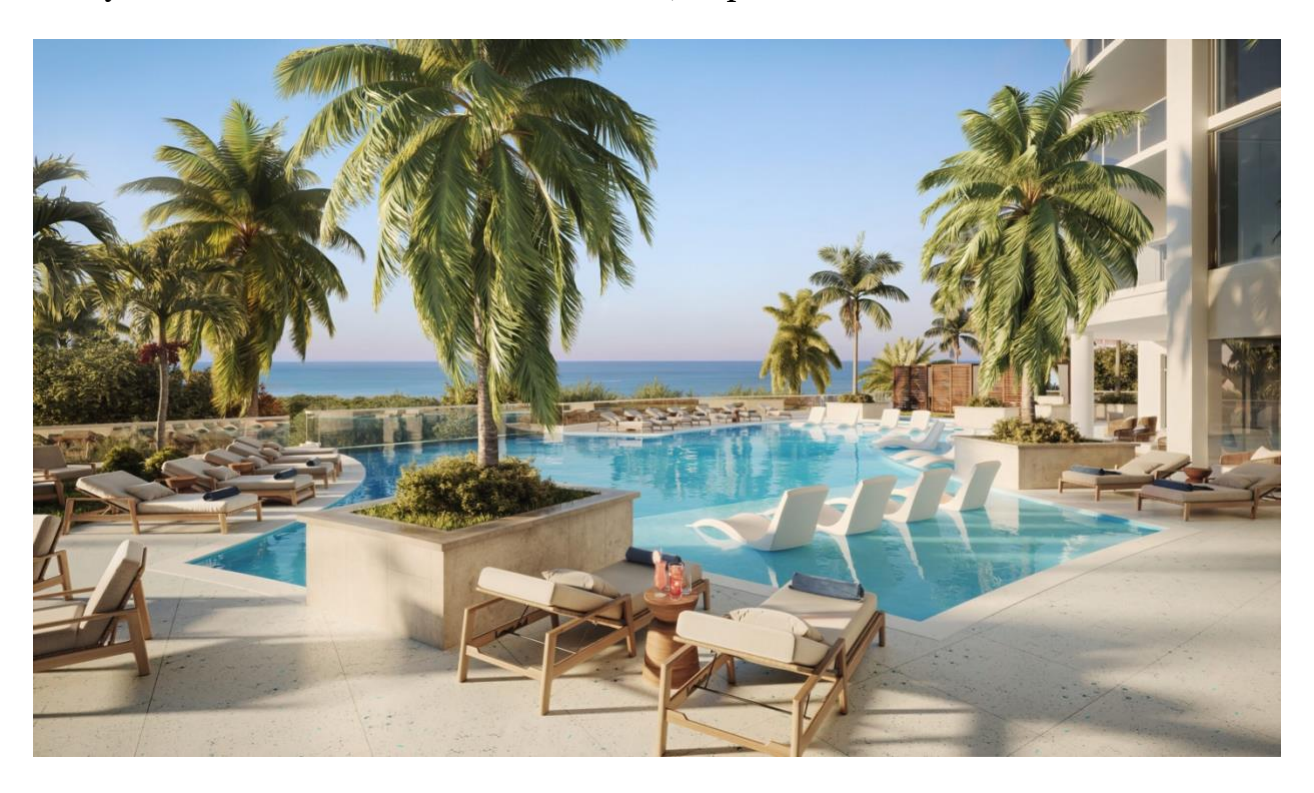
Gulf-facing pool at The Ritz-Carlton Residences, Naples.