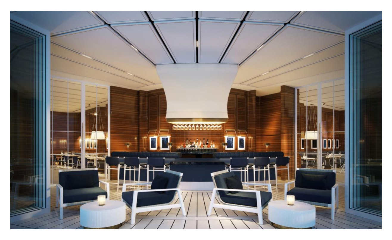
Pool bar at The Ritz-Carlton Residences, Naples.

countertops, ceiling heights ranging from 10 to 12 feet, high-quality Wolf and Sub-Zero appliances, a mix of porcelain and wood flooring, and private elevator entrances.