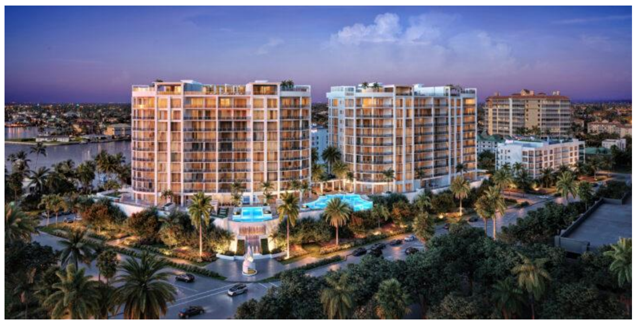
The Ritz-Carlton Residences, Naples at Dusk.